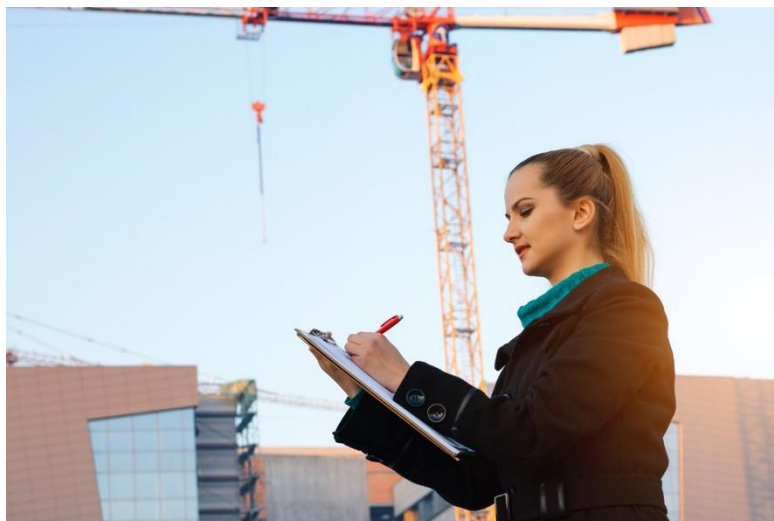
Visitor signing in